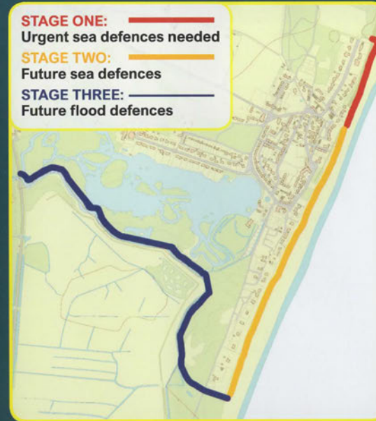
The map shows 3 areas of threat. The red line indicates a threat of erosion, the orange and blue lines, flooding.

The good news is that there is a solution. A rock armour defence spanning the north end will protect the beach, the land and the houses, and give us the opportunity to improve access and facilities for the enjoyment of all.